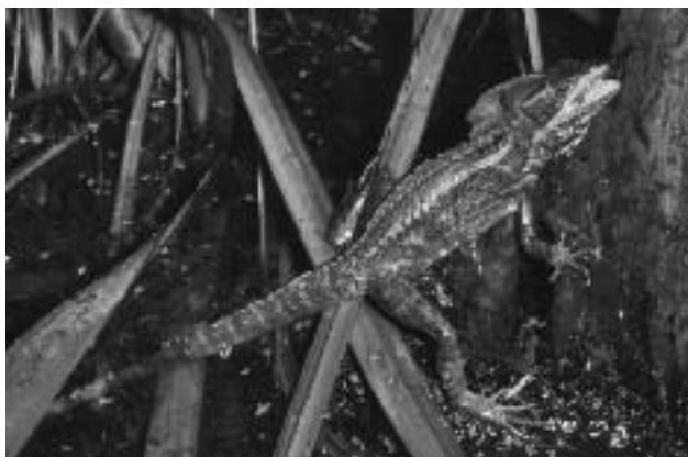
KEVIN M. ENGE

In Miami-Dade County, Basiliscus vittatus is known to feed on beetles (including the Eyed Elator, Alaus oculatus ), roaches, ants, hemipterans, and Ficus fruits (Meshaka et al. 2004). At Vanderbilt Beach County Park in Naples, Collier County, one of us (JCS) observed B. vittatus pursuing and eating large insects and arachnids 2.4–3.0 m away, as well as two B. vittatus fighting over a captured Anolis sagrei . At this site, we have used domestic crickets, as well as locally collected Wood ( Sesarma cinereum ) or Fiddler ( Uca pugilator ) crabs as bait on fishing rods to collect B. vittatus .