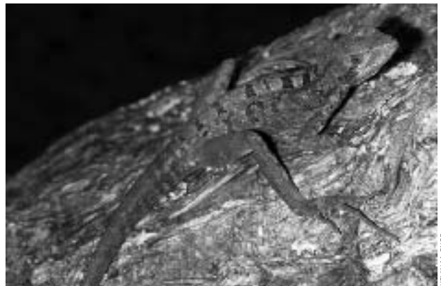
Adult female Brown Basilisk ( Basiliscus vittatus ) on a tree along Snapper Creek on Red Road between SW 88 and 100 streets, Miami-Dade County.