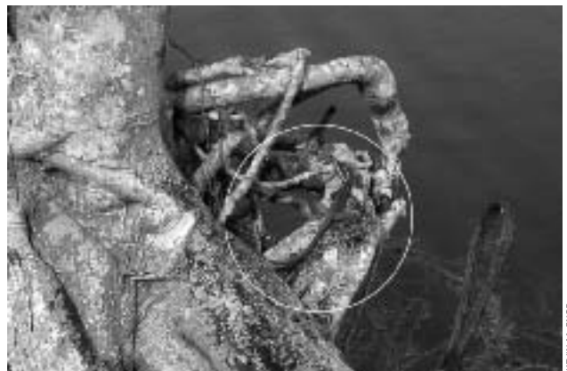
Adult male Brown Basilisk ( Basiliscus vittatus ) on a Fig ( Ficus sp.) along Snapper Creek on Red Road between SW 88 and 100 streets, Miami-Dade County.