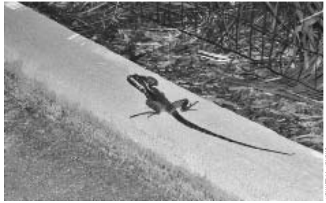
Juvenile Brown Basilisk ( Basiliscus vittatus ) on a palm at Crandon Park, Key Biscayne, Miami-Dade County.