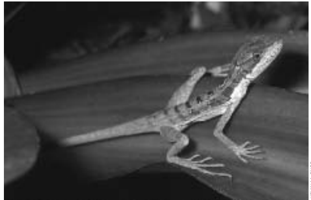
Juvenile Brown Basilisk ( Basiliscus vittatus ) on vegetation along Snapper Creek on Red Road between SW 88 and 100 streets, Miami-Dade County.

toed Amphiuma ( Amphiuma means ), Bufo marinus , Eleutherodactylus planirostris , Green Treefrogs ( Hyla cinerea ), Cuban Treefrogs ( Osteopilus septentrionalis ), Anolis carolinensis , A. sagrei , Hemidactylus mabouia , Corn ( Elaphe guttata ) and Yellow Rat ( E. obsoleta ) snakes, Southern ( Nerodia fasciata ) and Florida Green ( N. floridana ) watersnakes,