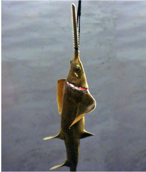
Fig. 1. A 1.7 m estimated total length Pristis pectinata with an elastic band encircling its body at the origin of the pectoral fins that was caught with hook and line in July 1996 in the Caloosahatchee River (near Fort Myers). The band was used to hang the sawfish for the photo, then it was removed before the fish was released.

covered all surfaces of the PVC pipe; however, it is unknown whether they attached to it before or after the sawfish encountered it. The pipe was removed before the sawfish was released.